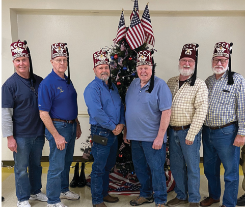
Cast Officers 2021