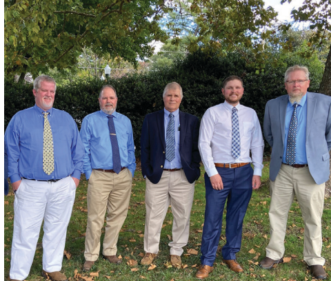
Cast New Members 2021