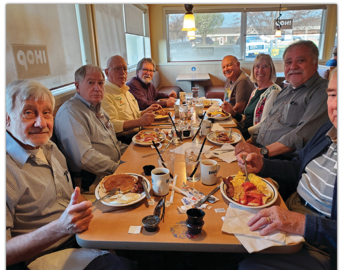
Valley Shrine Club Breakfast

We encourage all Shriners to attend our meetings to enjoy fellowship with other Nobles, as well as voice their opinions on the business and activities of the Club.