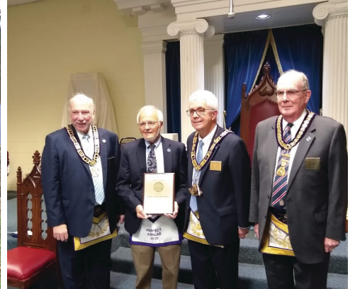
Ashlar Award Grandmaster